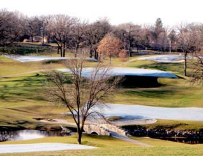
A: Covers on the greens in January; B: A view under a green cover January 6, 2012; C: Tee markers lined up; D: Busy at work painting tee markers.

Follow us on our blog: www.wakondagrounds.blogspot.com